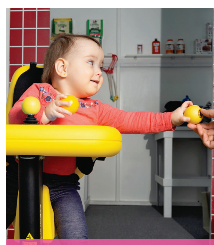
Integrated table and backrest is supportive and allows freedom of movement

The midline joystick promotes bilateral upper extremity use